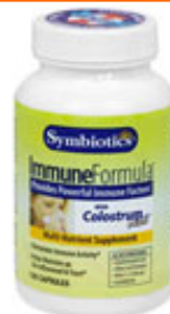
Colostrum Plus Immune

Enhances immune activity. This immune balancing action is important for your family!