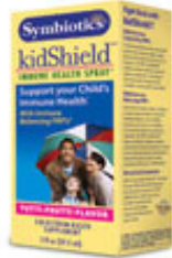
Kidshield Immune Spray

Nourish your defense system with Nutrapathics Nutra-Mune!