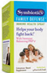
Family Defense Immune Spray

KidShield by Symbiotics has a delicious Tutti Frutti flavor children love.