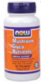
Mushroom Glyco Nutrients

I have counseled parents who expect their toddler to tidy up his room or who demand that their 3 year old child refrain from making a mess when he eats. This is unreasonable and ill informed behavior from adults and will place too much stress on a