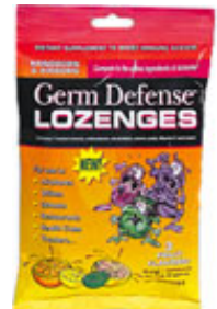
Germ Defense Lozenges

Overall health can often occur naturally if the body receives the proper nu