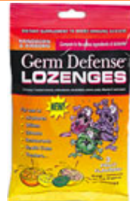
Germ Defense Lozenges

NaturalEco Organics is where we recommend you go for Organic , natural, chemical-free products and quality remedies for a safe, healthy journey for Mom and Baby, from Pregnancy to baby's Nursery !